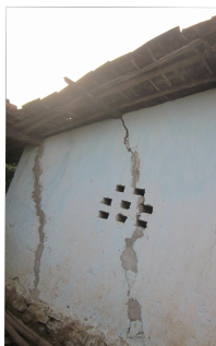
Figure 3: Cracks in the walls of the house due to the blasts in the mines.

The influence of mining on environment: The most visible impact/ damage are to the landscape by the mining process. The spilled oil, grease and other contaminants find their way in to the nearby fields and water courses, causing health hazards to inhabitants, cattle and damage to standing crop etc. The mechanized mining and processing of mineral causes air pollution due to emission of dust from drilling, blasting, loading, transport of mineral by dumpers, dumping operations, crushing and further handling operations. The noise level goes up due to the drilling, blasting, operation of diesel engines, machinery operations, loading and crushing operations. The blasting fly rocks in the nearby fields causing fear among the villagers, as it brings destruction to life and property.