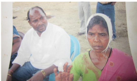
Figure 2: A Female brutally attacked by police in 2002.