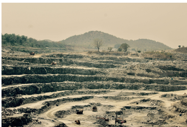
Figure 1: OCL Mining Site, Lanjiberna.

Prior to Independence the industrial activities in Sundergarh were confined only to Birmitrapur, the site of the limestone quarry. The establishment of the cement factory at Rajgangpur in 1951 and the steel plant at Rourkela in 1955 were mainly responsible for rapid industrial development in the district. During the past decades large, medium and a number of small-scale and ancillary industries in and around Rourkela began to concentrate and created an industrial complex. All the large-scale industries of the district viz., (i) the steel plant at Rourkela (ii) The fertiliser plant at Rourkela (iii) Cement factory at Rajgangpur (iv) Messar Utkal Machinery Ltd., at Kanshbahal (v) The limestone Quarry, Bisra, are in the complex. Sundergarh has emerged as one of the industrially advanced districts of Odisha. Industrial activities including mining and quarrying engaged 56,044 persons (17.29 percent of the total working population) in 1971. The Odisha Cement Limited (OCL), was established at Rajgangpur in pursuance of an agreement in December, 1948, between the State of Odisha and M/s. Dalmia Jain Agencies Limited (now M/s Dalmia Agencies Private Limited originally Managing Agents of the Company). Limestone, the principle raw material for manufacturing cement, is obtained from the company's own quarries at Lanjiberna situated at a distance of about 10 km, from the factory site (Mining Plan, 1989).