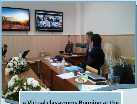
9 Virtual classrooms Running at the same time, Murmansk, April 2013