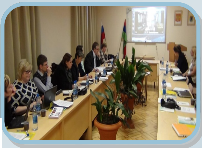
Intensive Work Guidance And Working Methods Oct 16-19,2012 Course In Petrozavodsk

Barents Cross Border University Development Project 2011 - 2013 University of Lapland, Faculty of Social Sciences PL 122 / P.O.Box 122, FIN-96101 Rovaniemi, FINLAND http://www.ulapland.fi/InEnglish/Webpages/Barents_Cross-Border_University_Development_BCBU.iw3