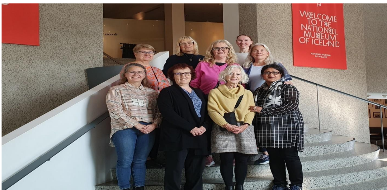
Picture from Excursion to the National Museum