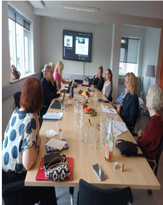
Pictures: Discussion about the book process- By editors & authors experiences and comments