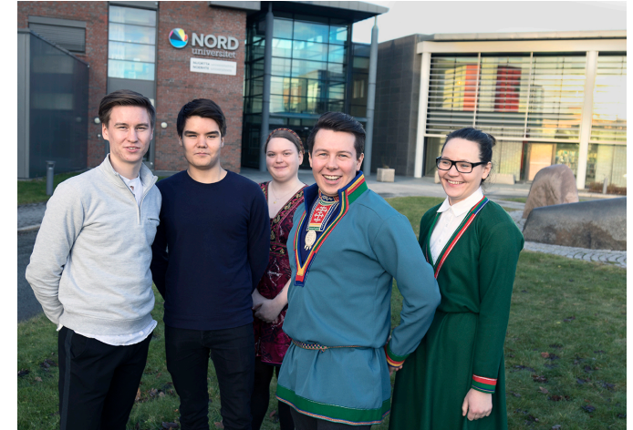
Class of 2018

Kindergarten Teacher Education with (Lule/South) Saami Profile